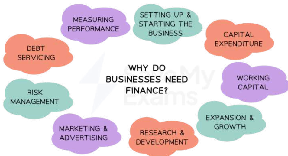
Diagram: why businesses need finance

Copyright © Save My Exams. All Rights Reserved